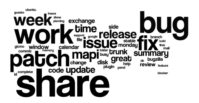
Figure 7: Tag cloud of top 50 words used in the Evolution IRC meetings in 2008

spot the most frequently discussed words in the meetings and we can infer the most popular topics in the meetings.