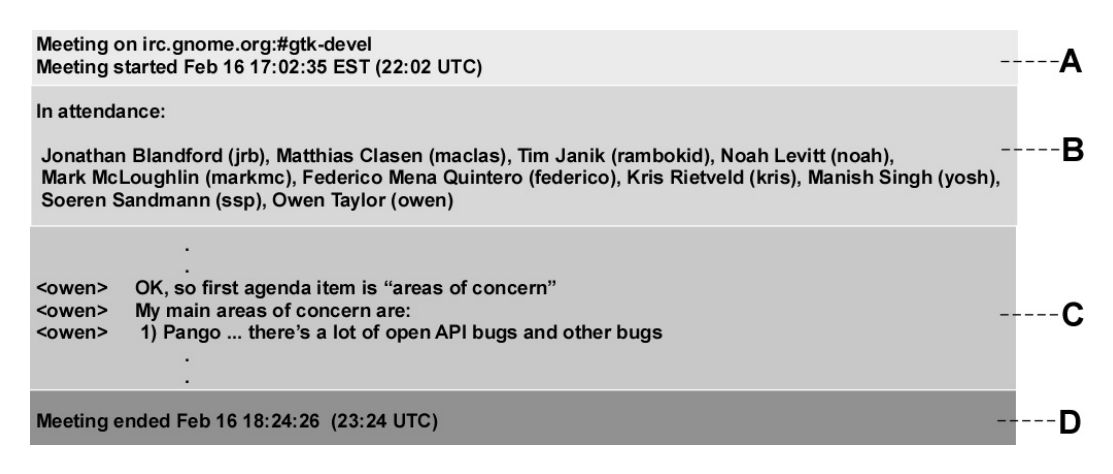
Figure 4: Sample IRC meeting log

The Evolution project started archiving their IRC meeting logs in 2005. The logs for 2006 were not available on their web site, therefore, in our study we use the IRC meeting logs from the years 2005, 2007 and 2008. The IRC meeting logs for the GTK+ project were archived since 2004 till present. In our study, we considered the logs from the time they were first archived till the end of December 2008.