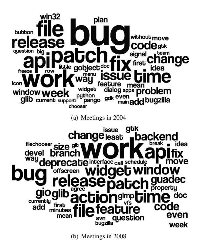
Figure 6: Tag cloud of top 50 words used in the GTK+ IRC meeting