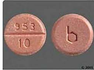
5x - 10mg Dexedrine (Pure Dextroamphetamine) ₪4.94