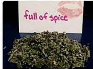
14 grams (1/2 Ounce) of Nebula JWH-122 ₪2.63