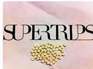
100x 200mg White XTC 'Speakers'