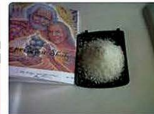
3g Methylone Crystals -₪50-Lab Grade