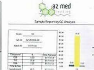
1 Gram OG KUSH OIL 81% THC 90% TOTAL ₪4.13