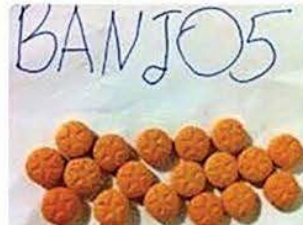
100 x Orange Star Very high MDMA content 180mg