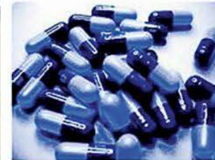
20 x 25mg Cialis ₪2.57