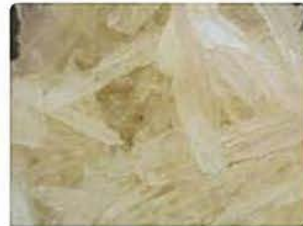
3.5g Crystal Meth Ice Shards ₪31.92