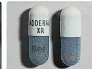
15mg Adderall Extended Release (1 Capsule)