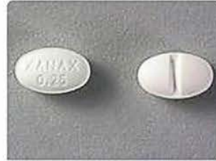
2 x 0,25 mg Xanax (Alprazolam) ₪1.50